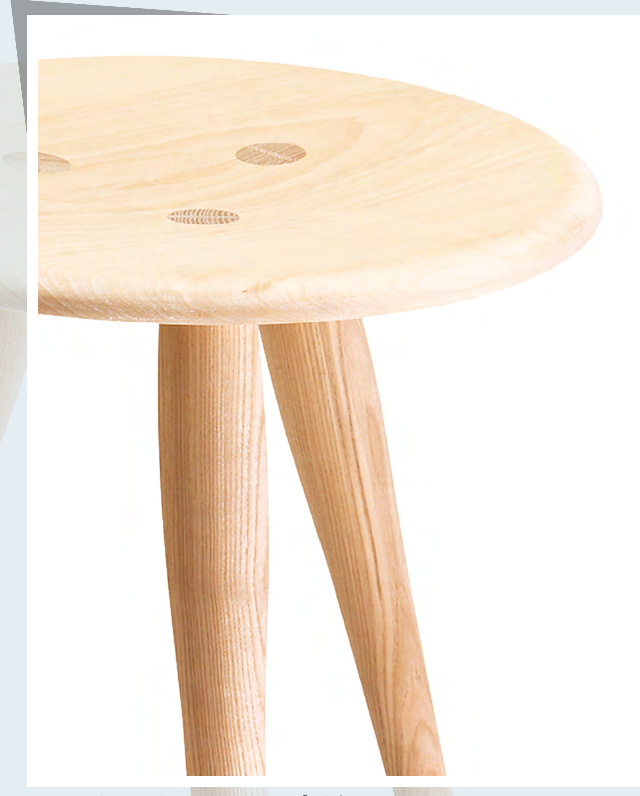
Tripod stool, Anton Mohr, Bregenzerwald, Austria