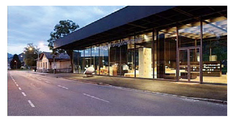
Werkraum House, designed by Peter Zumthor, Andelsbuch, Bregenzerwald, Austria.

In order to lead the craft into a prosperous future, the cooperation has taken measures to attract young people to start a career in craft, and to find adequate ways to pass on the skills and knowledge. These measures have been crucial for all member companies, as they help the numerous