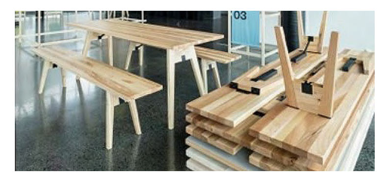
Exhibition object bench and table set, foldable. Tischlerei Anton Mohr and Gerola Metalltechnik.

The object of a foldable set, called KLAPPER 200, is the visual and qualitative upgrade of a quintessential piece known as the "Bavarian beer table," a