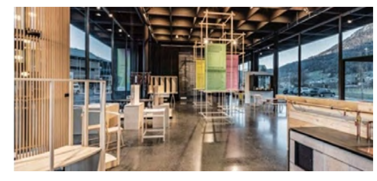
From Display Window to Knowledge Display. Exhibition on knowledge and collaboration in craft, 27 February–31 October 2021, Werkraum House, Andelsbuch.

In the field of sharing and exchanging an expertise, the exhibition piece called Vision in Black compares and demonstrates the technique of blackening in three different craft businesses. A cabinet maker, a butcher and a steel blacksmith use all the same techniques in order to care for, to preserve, and to protect their products. The cabinet maker uses charring as a tool to give his table a new sensory quality. This requires a specific and