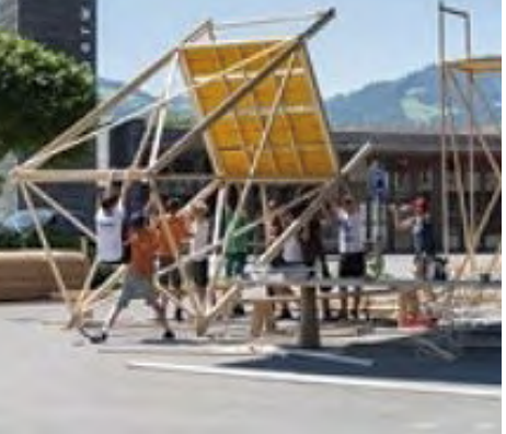
Werkraum School students building a structure of wood, supported by design teachers, coaches and craftsmen. Learning Lab 2019.